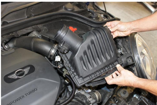
5. Remove the 10mm hex bolt located on driver side of air filter box then lift off. NOTE: There are [2] pin mounts that sit into rubber grommets on bottom back side, so a little effort may be required to lift air filter box off rubber mounts.