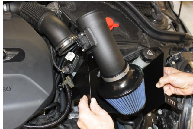
10. Install assembled NM Air Intake into lower rubber mounts.