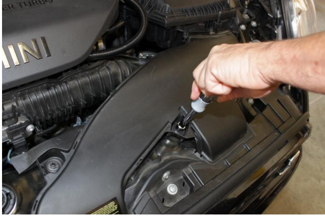
1. Remove the (2) 10mm nuts that hold down front air duct then push in tab at air filter box to disconnect.