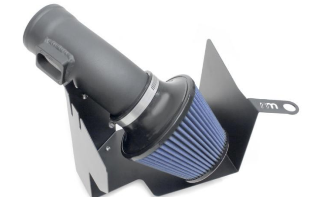
6. Mount NM Intake Pipe to Heat Shield using SS M6x12mm bolts and M6 lock nuts supplied. Now attach and tighten NM Air Filter.