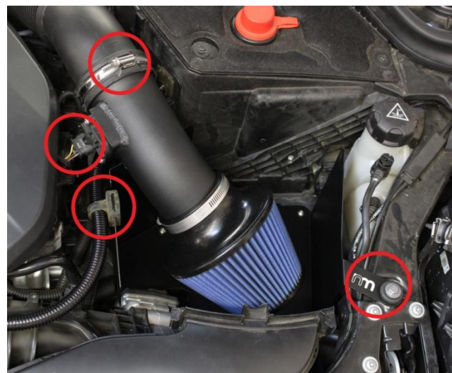
11. Install and tighten original air filter box M10 hex bolt to secure Heat Shield.

Attach turbo intake hose to NM intake pipe then tighten clamp using 7mm Nut Driver.