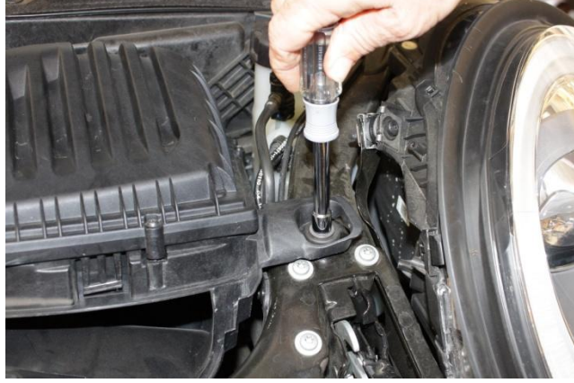
6. Mount NM Intake Pipe to Heat Shield using SS M6x12mm bolts and M6 lock nuts supplied. Now attach and tighten NM Air Filter.