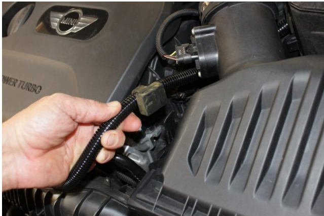
3. Disconnect electrical connector from MAF (Mass Air Flow) sensor. First pull outward grey tab then squeeze to release connector.