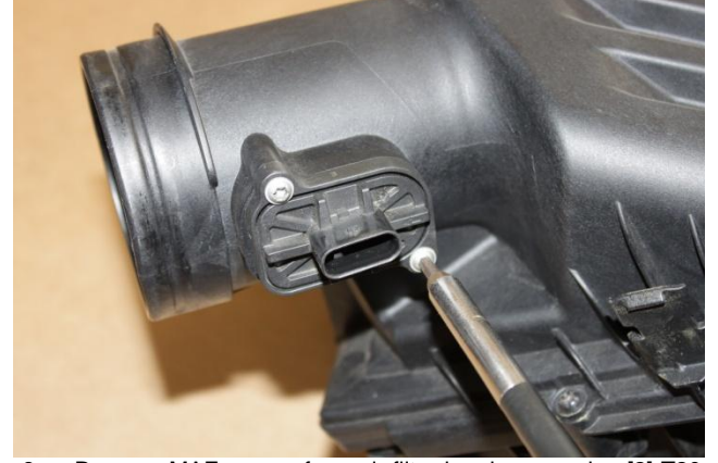
10. Install assembled NM Air Intake into lower rubber mounts.