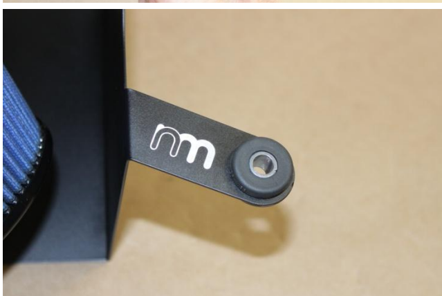
7. Remove metal sleeve and rubber grommet from original air filter box and install onto NM Heat Shield.