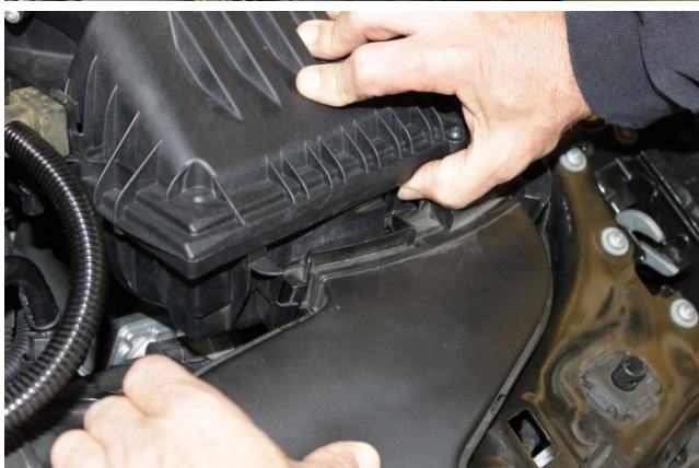
1. Remove the (2) 10mm nuts that hold down front air duct then push in tab at air filter box to disconnect.