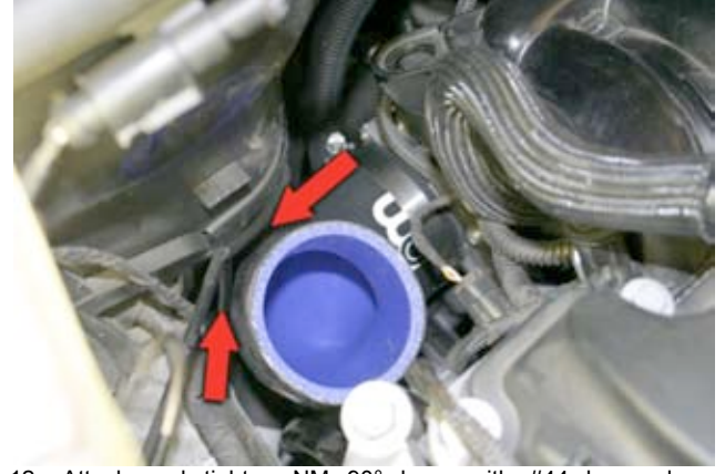
12. Attach and tighten NM 90° hose with #44 hose clamp supplied. NOTE: Keep ample clearance from firewall and brake line.