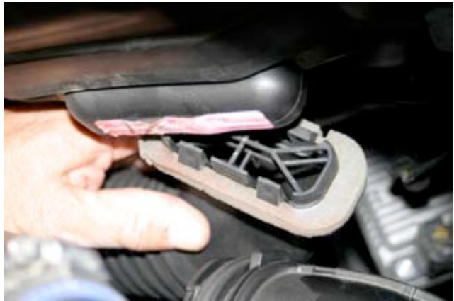
8. Disconnect sound amplifier ducting from firewall by squeezing and pulling down.