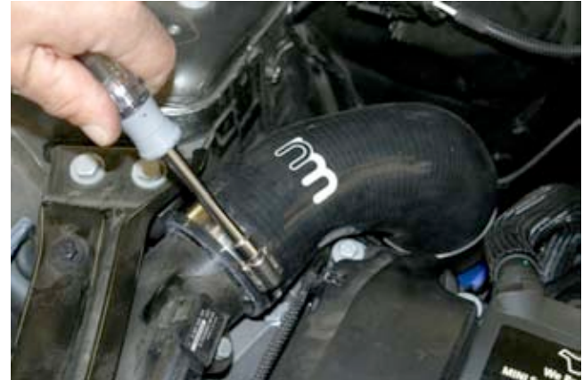
14. Install upper silicone air charge hose with #40 hose clamp and a #44 hose clamp at aluminum pipe and tighten both ends.