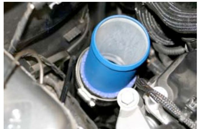
13. Install aluminum pipe with #44 hose clamp and tighten.