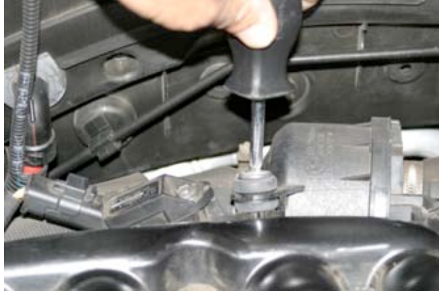
6. Located on back side of intake manifold, remove the Philips screw that retains the sound amplifier.