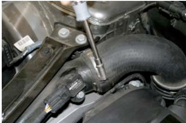
10. Loosen hose clamp and disconnect upper air charge hose.