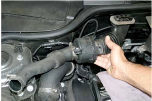
9. Now remove sound amplifier assembly.