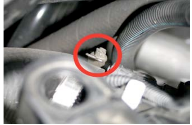
11. Loosen hose clamp and disconnect lower air charge hose from throttle body.