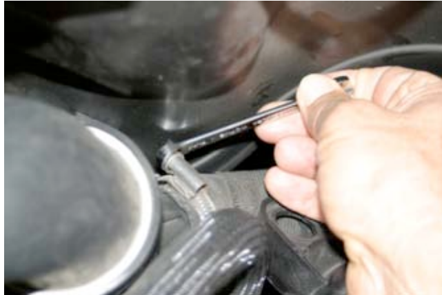
7. Undo hose clamp and remove sound amplifier hose from air charge pipe using a 7mm wrench.