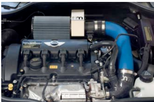
5. If you have NM Hi-Flow Induction Kit just remove filter.