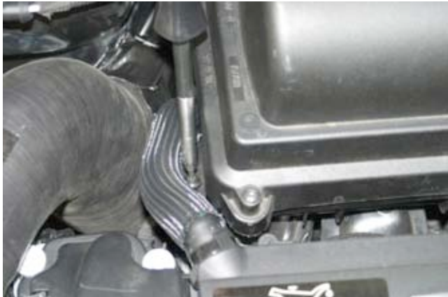
3. Remove T25 TORX screw located on passenger side of air filter box and lift off. NOTE: There are [3] pin mounts that are pushed into rubber grommet mounts on intake manifold, so effort may be required to lift air filter box off of mounts.