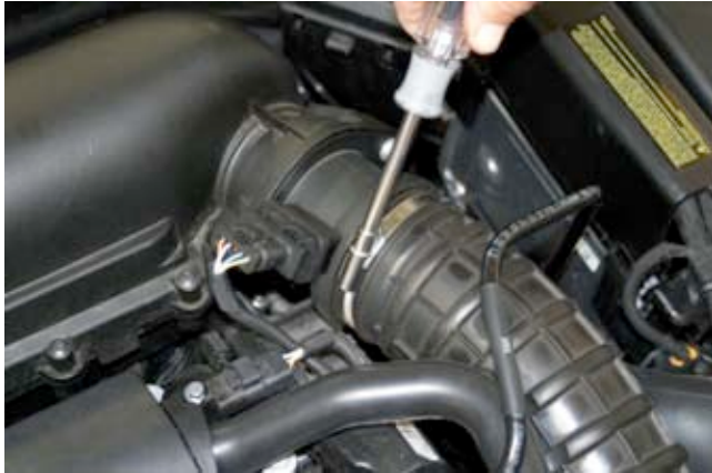
1. Remove OE turbo inlet hose from MAF (mass air flow) sensor. Use screwdriver or 7mm Nut Driver to loosen clamp.