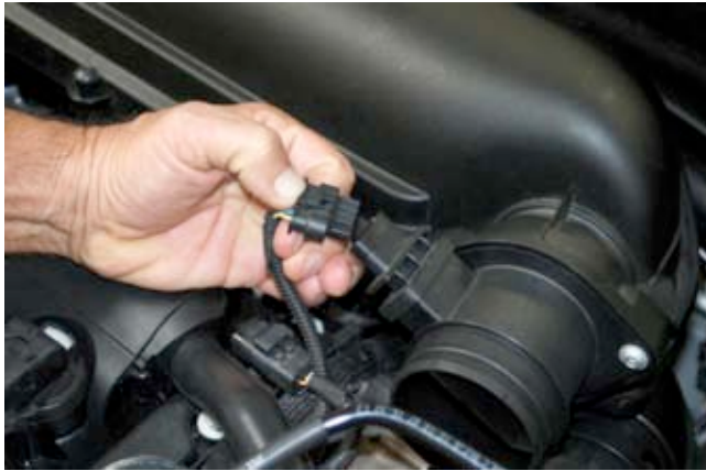
2. Disconnect electrical connector from MAF (if equipped).