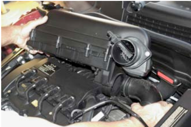
4. Locate fresh air pipe that is attached to air filter box. Disconnect fresh air pipe by rotating the 90° connection counter clockwise and pulling pipe away from air filter box. Remove air filter box from vehicle.